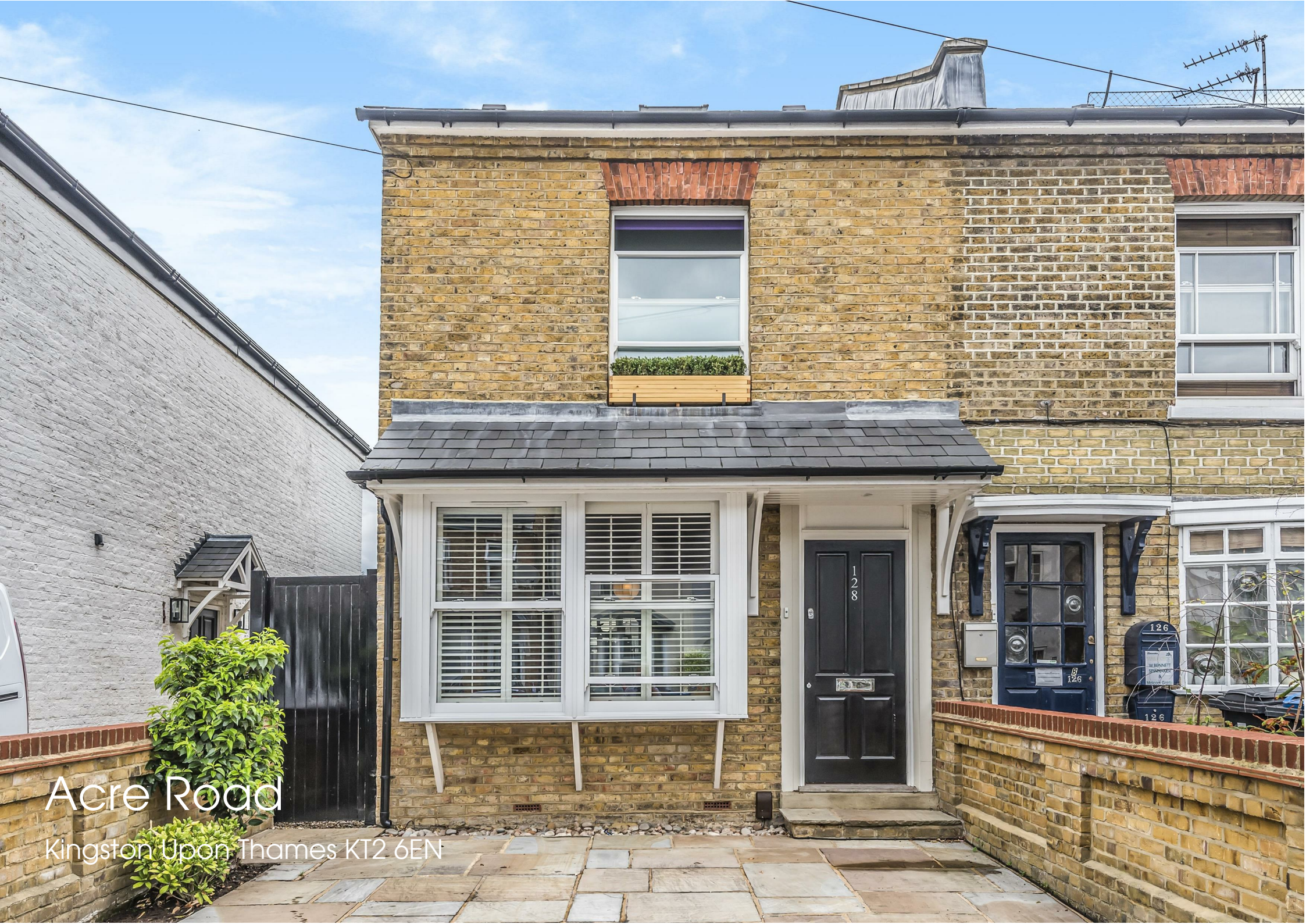
Acre Road Kingston Upon Thames KT2 6EN